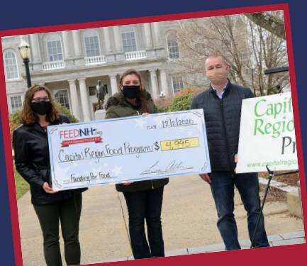
Capital Region Food Program Provided funding to purchase food for local families & individuals in need - $5,000

New Horizons for NH Funded 700 meals, served daily - $5,000